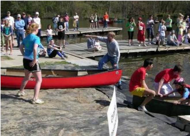
POCAHONTAS LITTLE BIG ADVENTURE DAY 2009

Race: Adult/Child Team Adventure Triathlon: ½ mile canoe, 3.5 mile trail bike ride, 1.5 mile run. Teams compete in all 3 events and finish together!