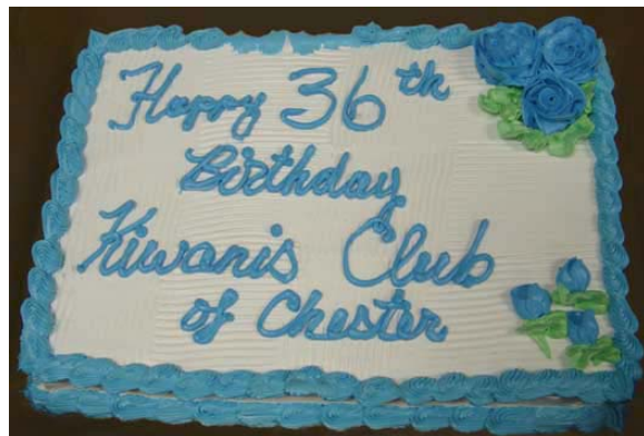
Cake and ice cream were served at the April Board Meeting in celebration of the club's 36th anniversary of Kiwanis Club of Chester Organization on March 28, 2008