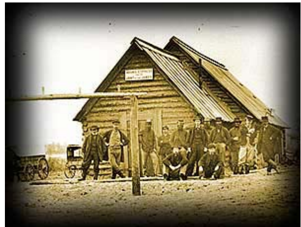
Adams Express Office, Bermuda Hundred, Virginia, ... during the period of the American Civil War