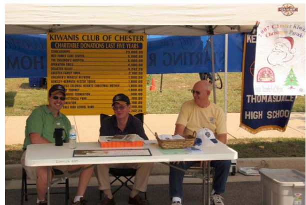
Kiwanis Club of Chester, Chester, Virginia, ... during the recent Chesterfest.

Note that the expressions on faces of men sitting in hot sun has not change in a hundred and fifty years!