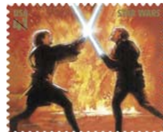
© 2007 USPS. All Rights Reserved.

These commemorative stamps feature images from all six movies in the Star Wars saga.