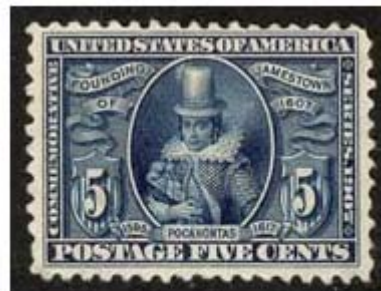
First Day: May 3, 1907 7,980,594 issued

"As with the Columbian, Trans-Mississippi, Pan-American, and Louisiana Purchase stamps that preceded them and as with many of the 'commemorative' sets issued in the following decades, the Jamestown stamps were issued to promote an exposition - the Jamestown Exposition of 1907 at what is now the Norfolk Naval Base in Virginia. For once, the date of commemoration actually represented an event, the 300th anniversary of the Jamestown Settlement in 1607."