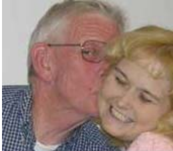
Will you be my Valentine?